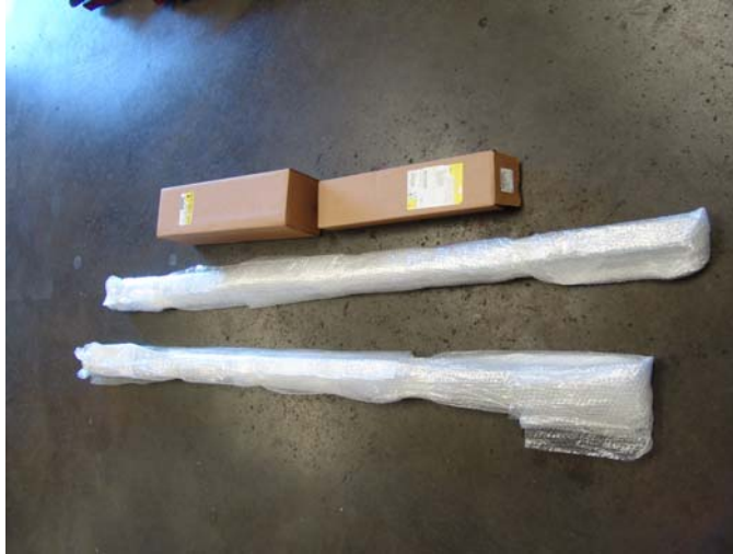
Figure 1: Unpack

Start your install by supporting the car with 4 jack stands on a level surface about 12" or more off of the ground. Take some time to wash the area that the rockers are going on, as you do not want to trap any dirt or debris between them and the paint of the car.