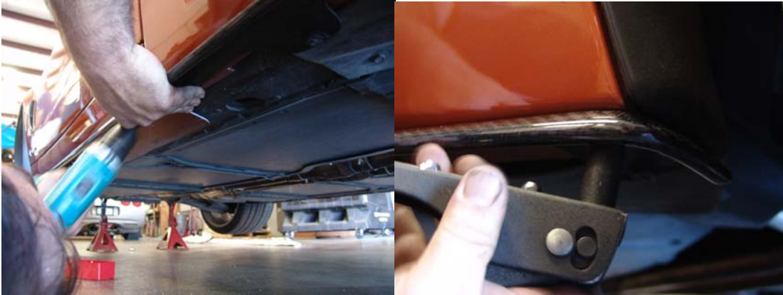
Figure 8: Blow out area being drilled before Rivet install