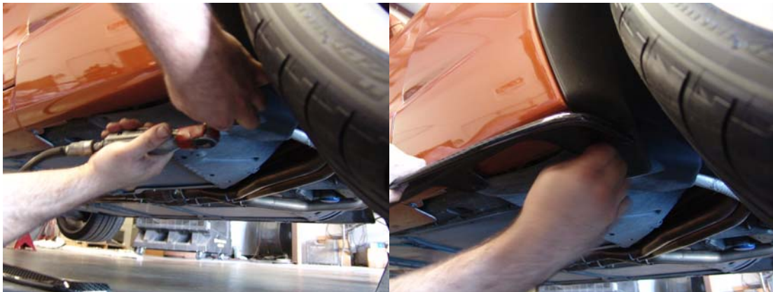
Figure 4: Starting Rocker Install

Now that the mud flap and rocker are loosely lined up on the car you will need to attach the rocker panel to the mud flap at the lower point. You will see two holes in the flap and two holes in the rocker panel already there. Use the two supplied 3/16” rivets with back up washer on the inside rivet. Go ahead and snap the rivets in place at this time with a hand held rivet gun.