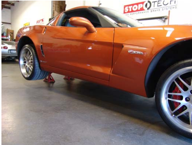
Figure 2: Support and Clean

Start your install by supporting the car with 4 jack stands on a level surface about 12" or more off of the ground. Take some time to wash the area that the rockers are going on, as you do not want to trap any dirt or debris between them and the paint of the car.