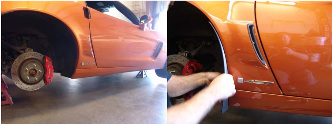
Figure 3: Removal of rear wheel and install of ‘mud flap’

Once you have the one bolt in the flap you will now start by mocking up the rocker panel. You will start by removing two screws at the front fender under the car and these will be used to locate the rocker to the car. Lay the rocker panel up against the car and start the two screws at the front. DO NOT TIGHTEN THESE YET!