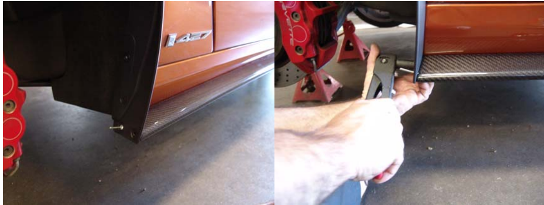
Figure 5: Installing Mud Flap to Rocker Panel

Now that the two pieces are joined you will need to drill the remaining attachment points into the rear fender and lower rocker panel. Use the supplied rivets to attach the mud flap to the car first then work to the rocker panel.